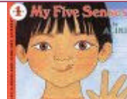
My Five Senses